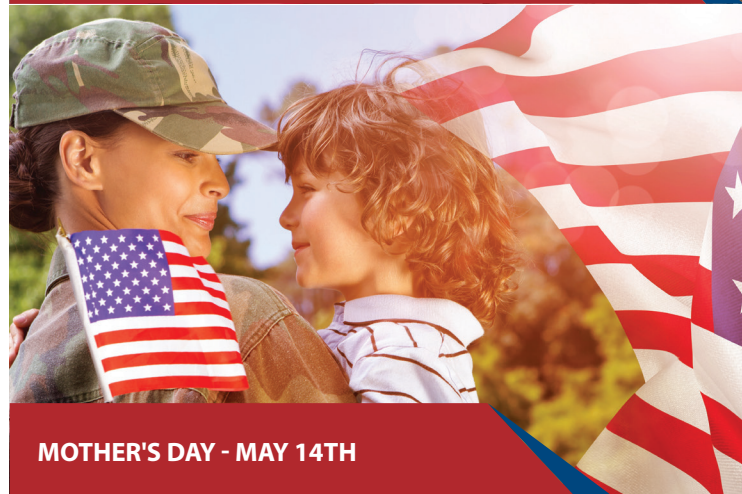
MOTHER'S DAY - MAY 14TH