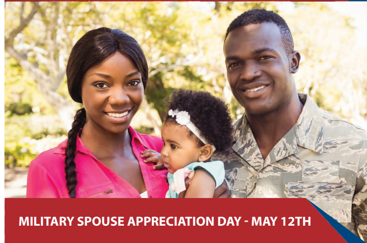
MILITARY SPOUSE APPRECIATION DAY - MAY 12TH