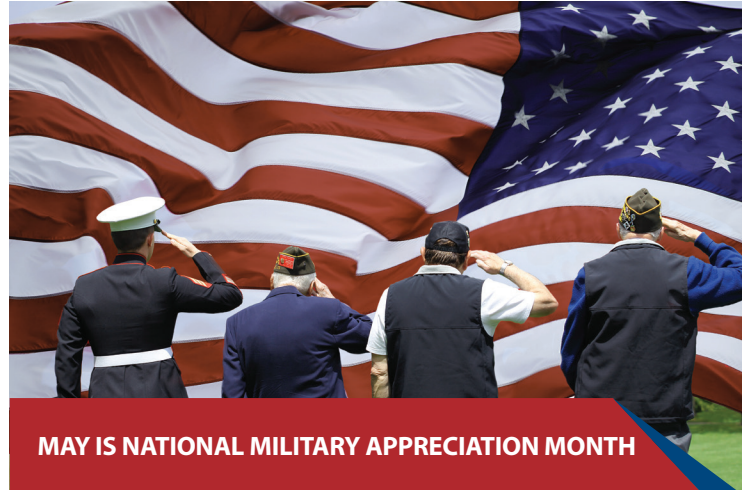
MAY IS NATIONAL MILITARY APPRECIATION MONTH

Need a replacement bulb or a new filter? Stop by your neighborhood clubhouse for self-help items! A full list of items can be found in the attached flyer.