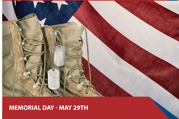
MEMORIAL DAY - MAY 29TH