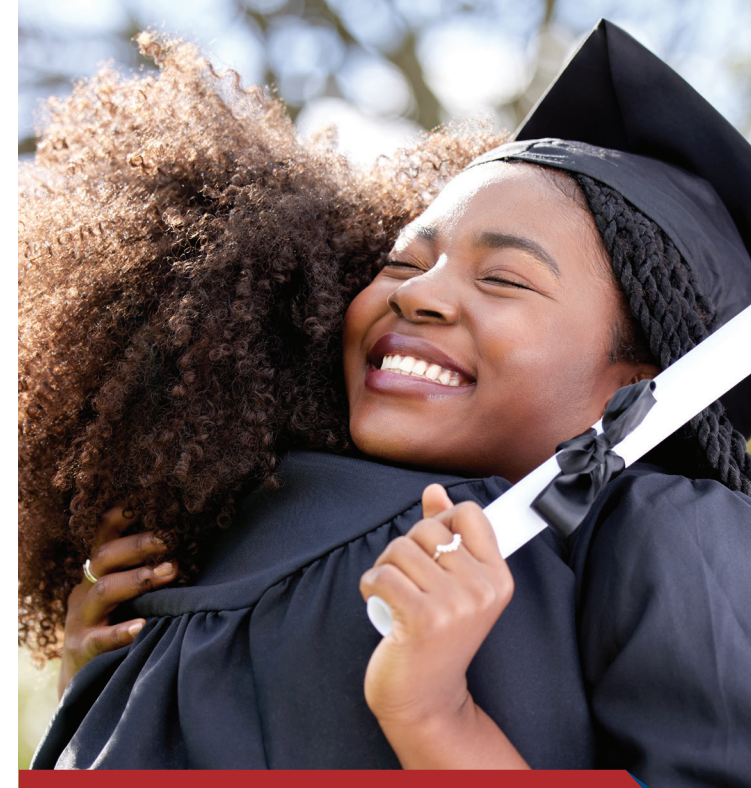
HUNT MILITARY COMMUNITIES FOUNDATION SCHOLARSHIP STARTS - JANUARY 12TH

Office Hours: 8 AM – 5 PM Office Number: 618-418-4911 Email: Scott@HuntCompanies.com Facebook: ScottFamilyHousing Website: ScottFamilyHousing.com